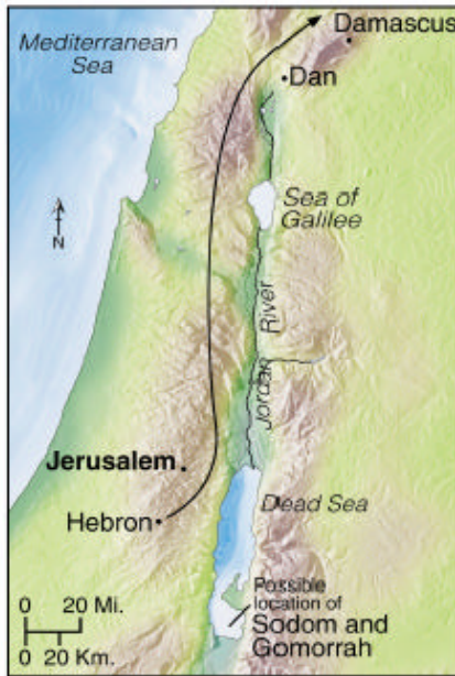
Tyndale Handbook of Bible Charts & Maps, pg. 7

their inhabitants, and upon what grew there (vs. 31-32) Abraham saw smoke as from a furnace