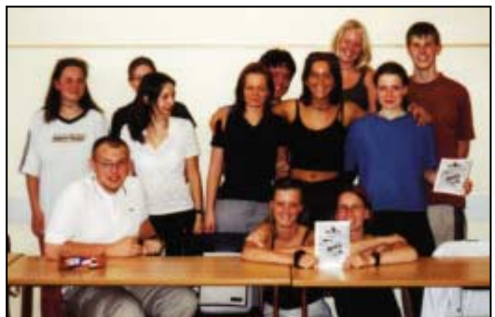
They were taught the differences between Mormons and Restorationists