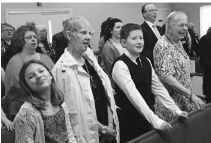
Women's Retreat at the Parkersburg Restoration Branch, West Virginia, in April of 2019