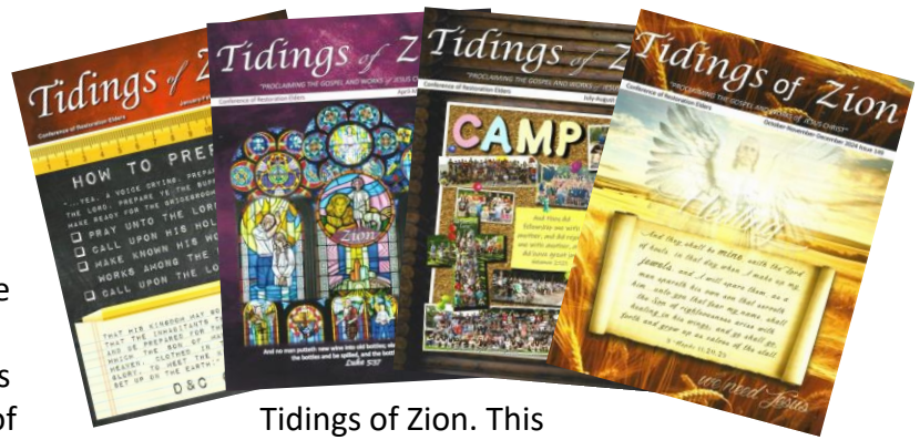
Tidings of Zion. This

The Publication Council of the Conference of Restoration Elders is responsible for proclaiming the gospel and works of Jesus Christ through the quarterly publication of