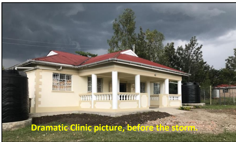
Dramatic Clinic picture, before the storm.

“Been at my lowest of health condition ever for now almost one year. I have visited hospitals and have been seen by doctors. I must confess that this doctor I started seeing on Saturday has amazed me, spent time with me, started on comprehensive investigations and reignited my fighting spirit, which was